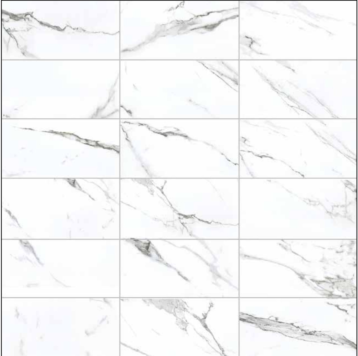
12x24 MARBLE IMITATION STATUARIO HD PORCELAIN TILE