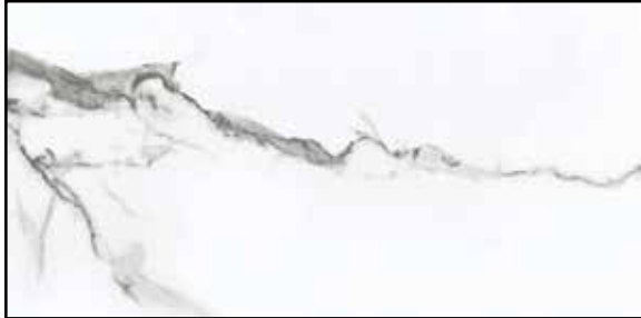
12x24 MARBLE IMITATION STATUARIO HD PORCELAIN TILE 302-103(M) 302-101(P)