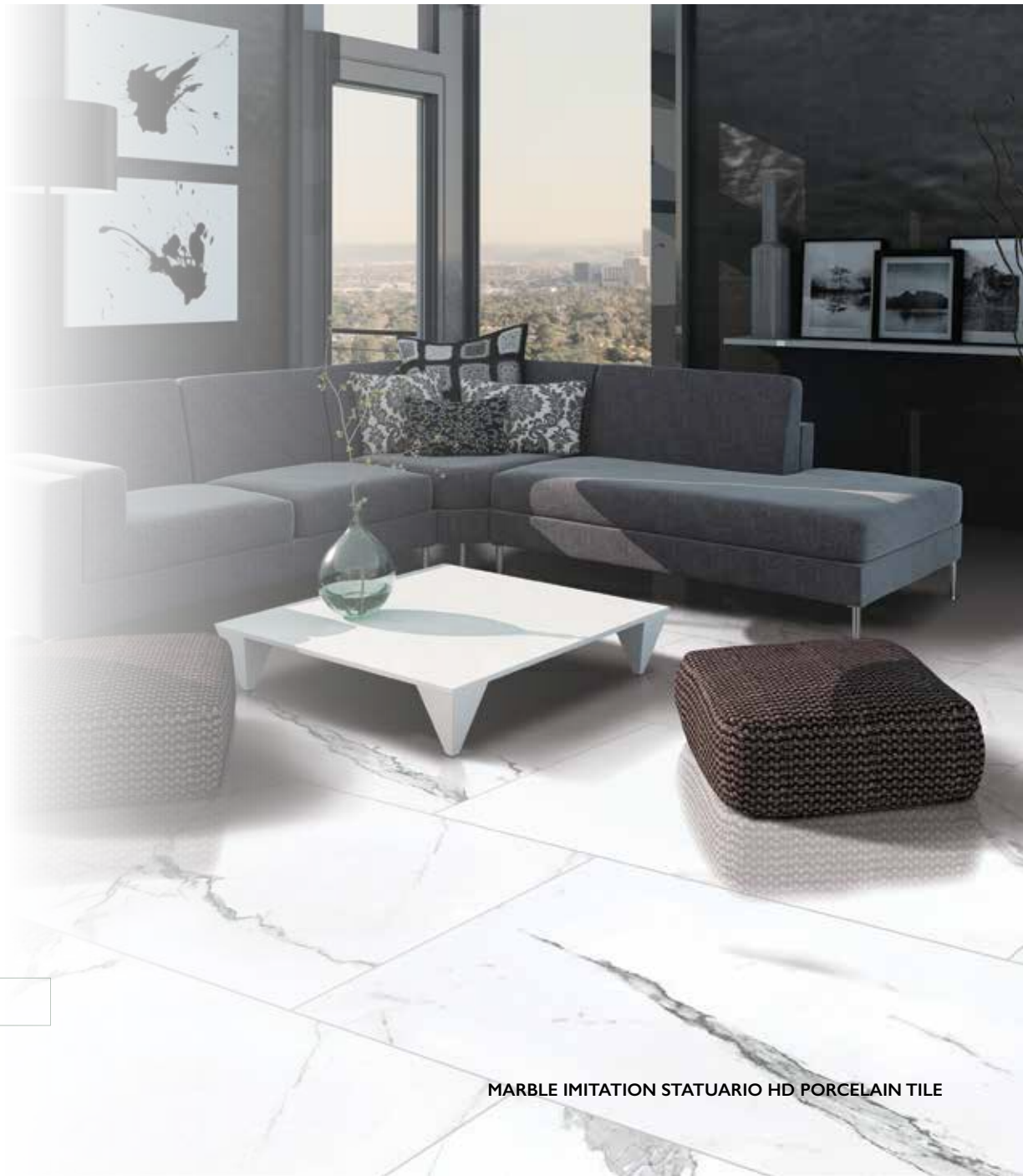
MARBLE IMITATION STATUARIO HD PORCELAIN TILE