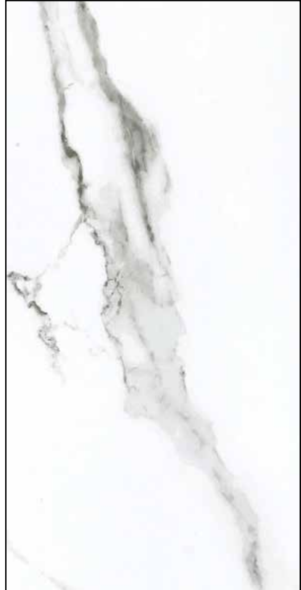
24x48 MARBLE IMITATION STATUARIO HD PORCELAIN TILE 302-105(M) 302-106(P)