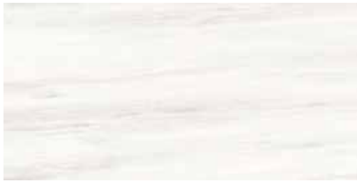
16x32 MAYFAIR SUAVE BIANCO HD PORCELAIN TILE 323-65-518(P) 323-65-521(M)