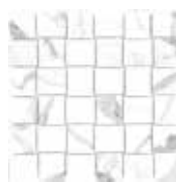
2x2 MAYFAIRSTATUARIO VENATO BASKETWEAVE MOSAIC HD PORCELAIN TILE 323-69-358(M)