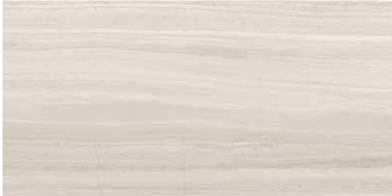
24x48 MAYFAIR STRADA ASH HD PORCELAIN TILE 323-69-919(P)