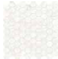
1.25x1.25 MAYFAIR SUAVE BIANCO HEXAGON MOSAIC HD PORCELAIN TILE 323-69-965(P)