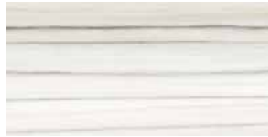
12x24 MAYFAIR ZEBRINO HD PORCELAIN TILE 323-69-946(P) 323-69-955(M)