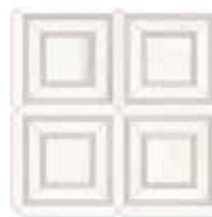
12x12 MAYFAIR SUAVE BIANCO PIAZZA MOSAIC HD PORCELAIN TILE 323-69-974(P)