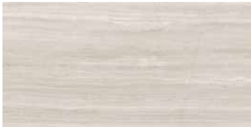
16x32 MAYFAIR STRADA ASH HD PORCELAIN TILE 323-65-516(P) 323-65-519(M)