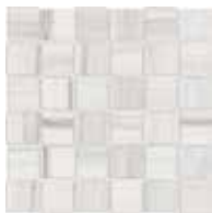
2x2 MAYFAIR ZEBRINO BASKETWEAVE MOSAIC HD PORCELAIN TILE 323-69-952(P) 323-69-961(M)