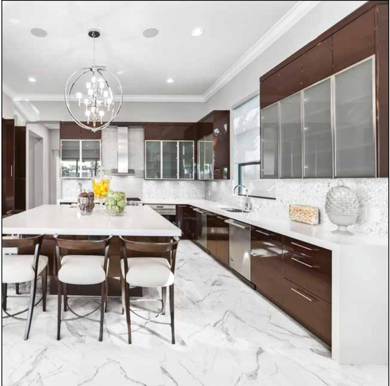
1.25X1.25 MAYFAIR STATUARIO VENATO HEXAGON MOSAIC HD PORCELAIN TILE