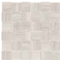
2x2 MAYFAIR STRADA ASH BASKETWEAVE MOSAIC HD PORCELAIN TILE 323-69-951(P) 323-69-960(M)