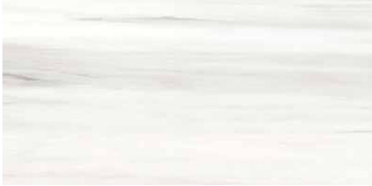
24x48 MAYFAIR SUAVE BIANCO HD PORCELAIN TILE 323-69-921(P)