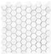
1.25x1.25 MAYFAIR VOLAKAS GRIGIO HEXAGON MOSAIC HD PORCELAIN TILE 323-69-924(P)