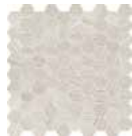
1.25x1.25 MAYFAIR STRADA ASH HEXAGON MOSAIC HD PORCELAIN TILE 323-69-963(P)