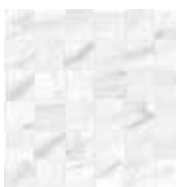
2x2 MAYFAIR VOLAKAS GRIGIO BASKETWEAVE MOSAIC HD PORCELAIN TILE 323-69-358(M)