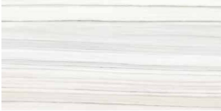
24x48 MAYFAIR ZEBRINO HD PORCELAIN TILE 323-69-920(P)