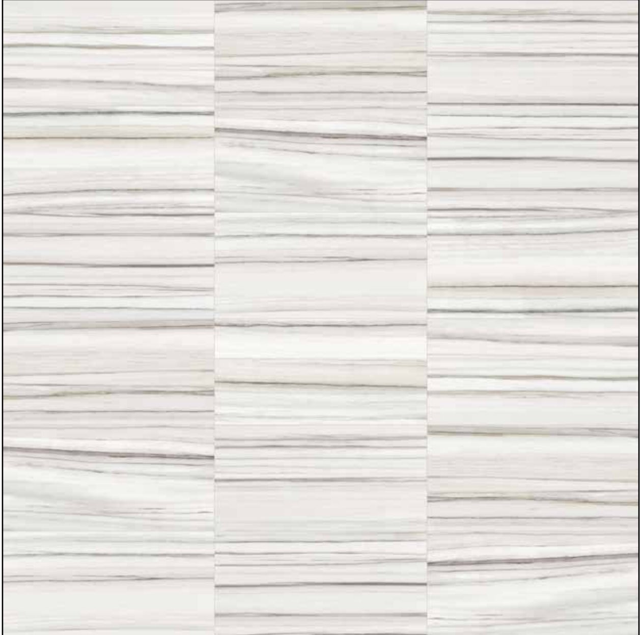
12x24 MAYFAIR ZEBRINO HD PORCELAIN TILE