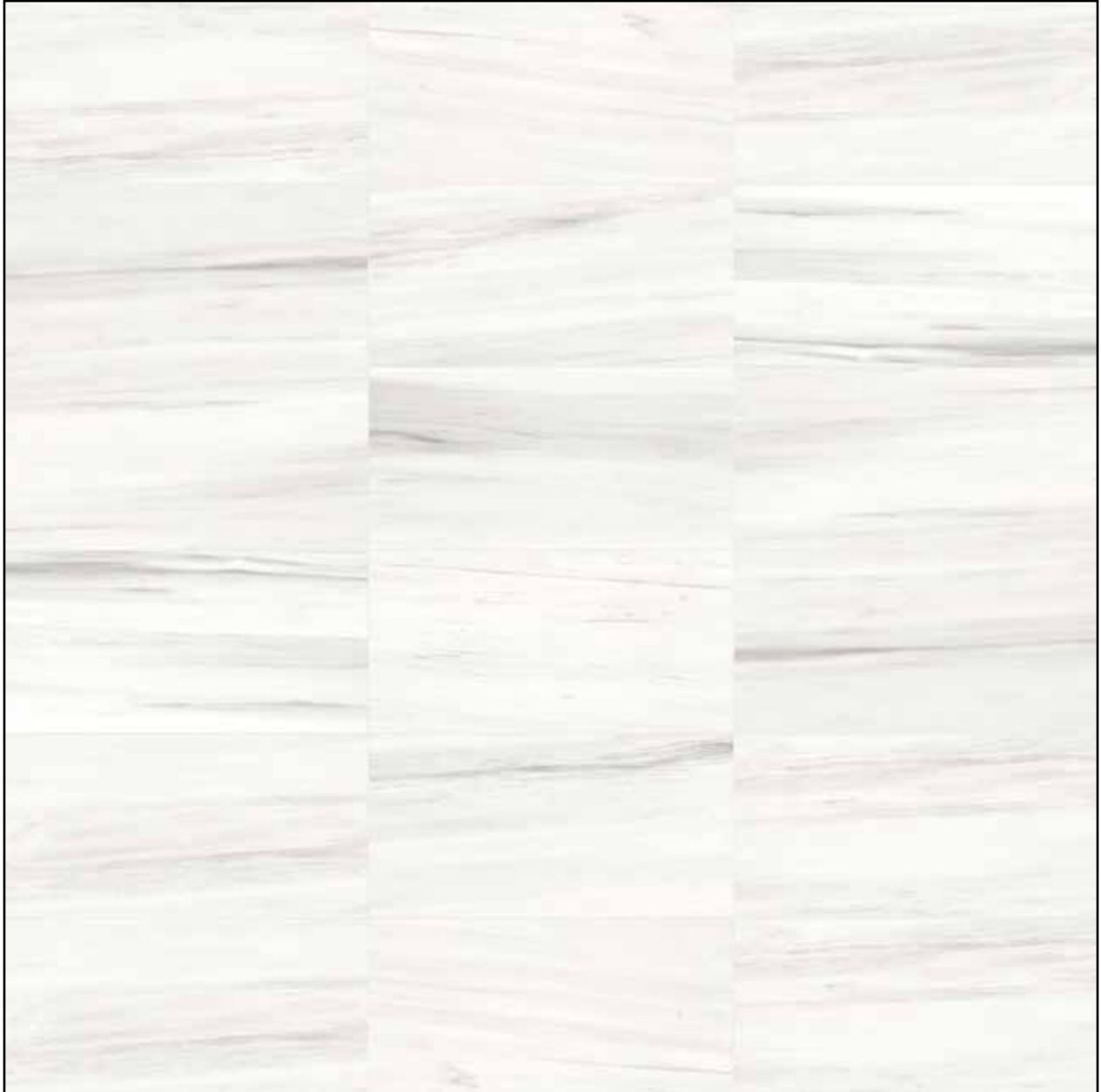
12x24 MAYFAIR SUAVE BIANCO HD PORCELAIN TILE