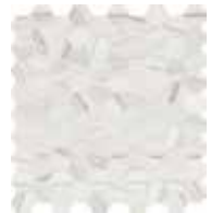
1.25x1.25 MAYFAIR ZEBRINO HEXAGON MOSAIC HD PORCELAIN TILE 323-69-964(P)