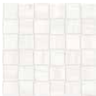
2x2 MAYFAIR SUAVE BIANCO BASKETWEAVE MOSAIC HD PORCELAIN TILE 323-69-953(P) 323-69-962(M)