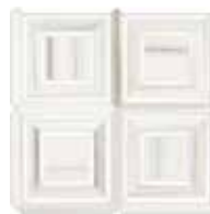
12x12 MAYFAIR ZEBRINO PIAZZA MOSAIC HD PORCELAIN TILE 323-69-973(P)