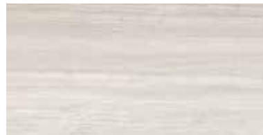
12x24 MAYFAIR STRADA ASH HD PORCELAIN TILE 323-69-945(P) 323-69-954(M)