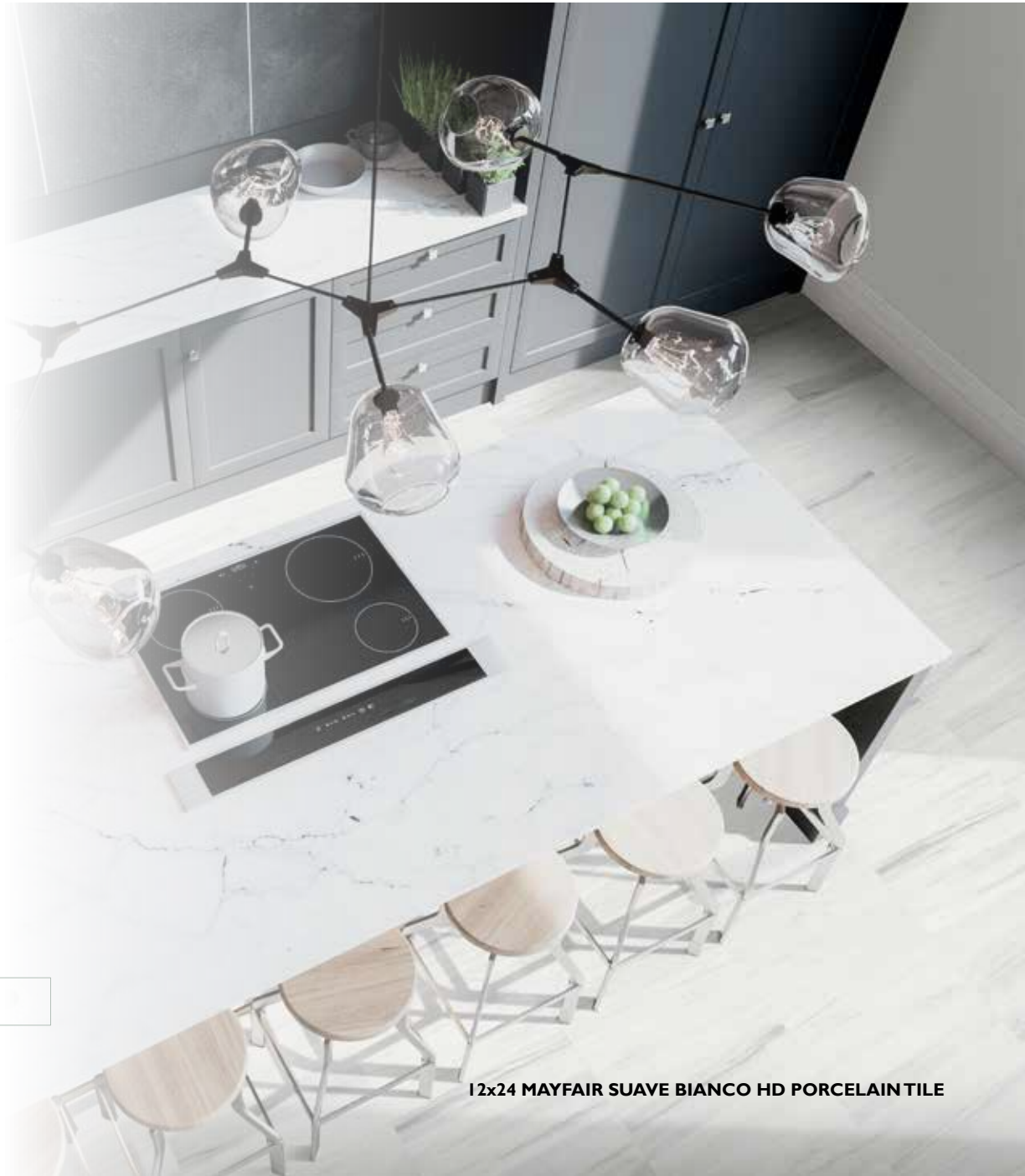
12x24 MAYFAIR SUAVE BIANCO HD PORCELAIN TILE