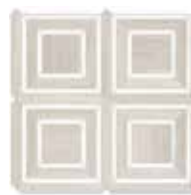
12x12 MAYFAIR STRADA ASH PIAZZA MOSAIC HD PORCELAIN TILE 323-69-972(P)