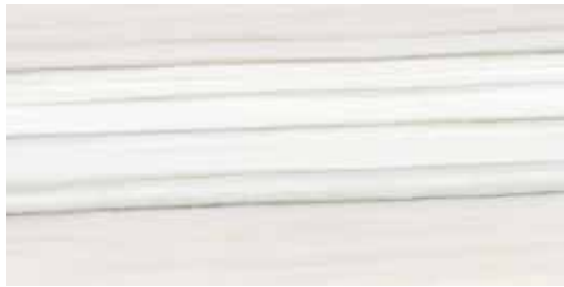
16x32 MAYFAIR ZEBRINO HD PORCELAIN TILE 323-65-517(P) 323-65-520(M)