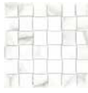
2x2 MAYFAIR CALACATTA ORO BASKETWEAVE MOSAIC HD PORCELAIN TILE 323-69-357(M)