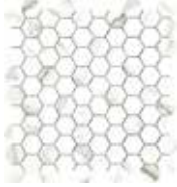
1.25x1.25 MAYFAIR CALACATTA ORO HEXAGON MOSAIC HD PORCELAIN TILE 323-69-922(P)