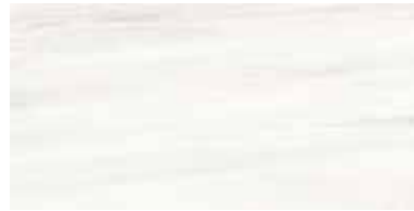
12x24 MAYFAIR SUAVE BIANCO HD PORCELAIN TILE 323-69-947(P) 323-69-956(M)